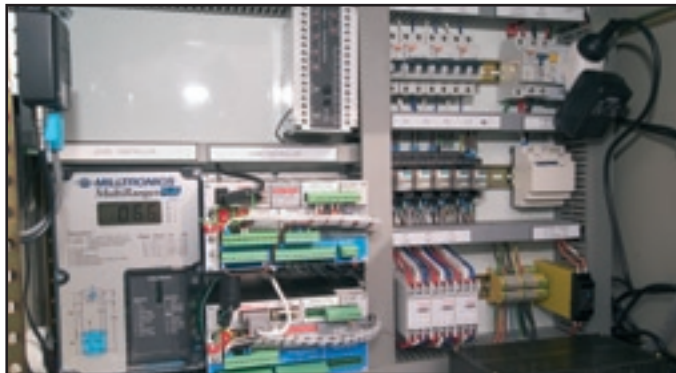
Control panel layout

PumpView delivers daily reports, with all history kept in an on-line database, so managers can look at trends. Comparisons of seasons, and month by month pump station performance allows planning for different cycles and settings that are most appropriate.