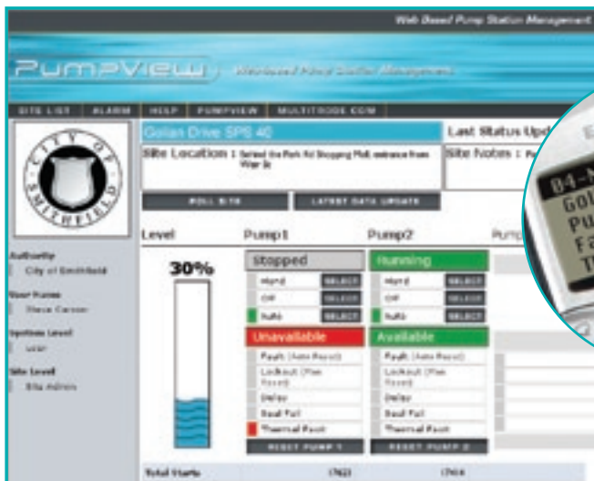
Alarms are sent automatically to the web and to any nominated mobile phone via SMS

The system also delivers a broad range of historical data that can forewarn of impending problems with pump motors, electrical supply or potential blockages and serve as the basis for a proactive maintenance program.