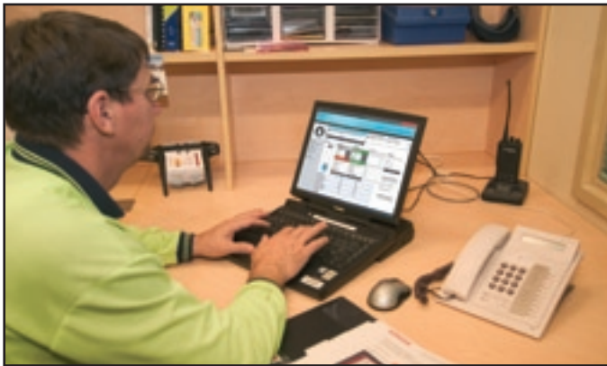
Any PC with an internet connection can be used to monitor and control the network