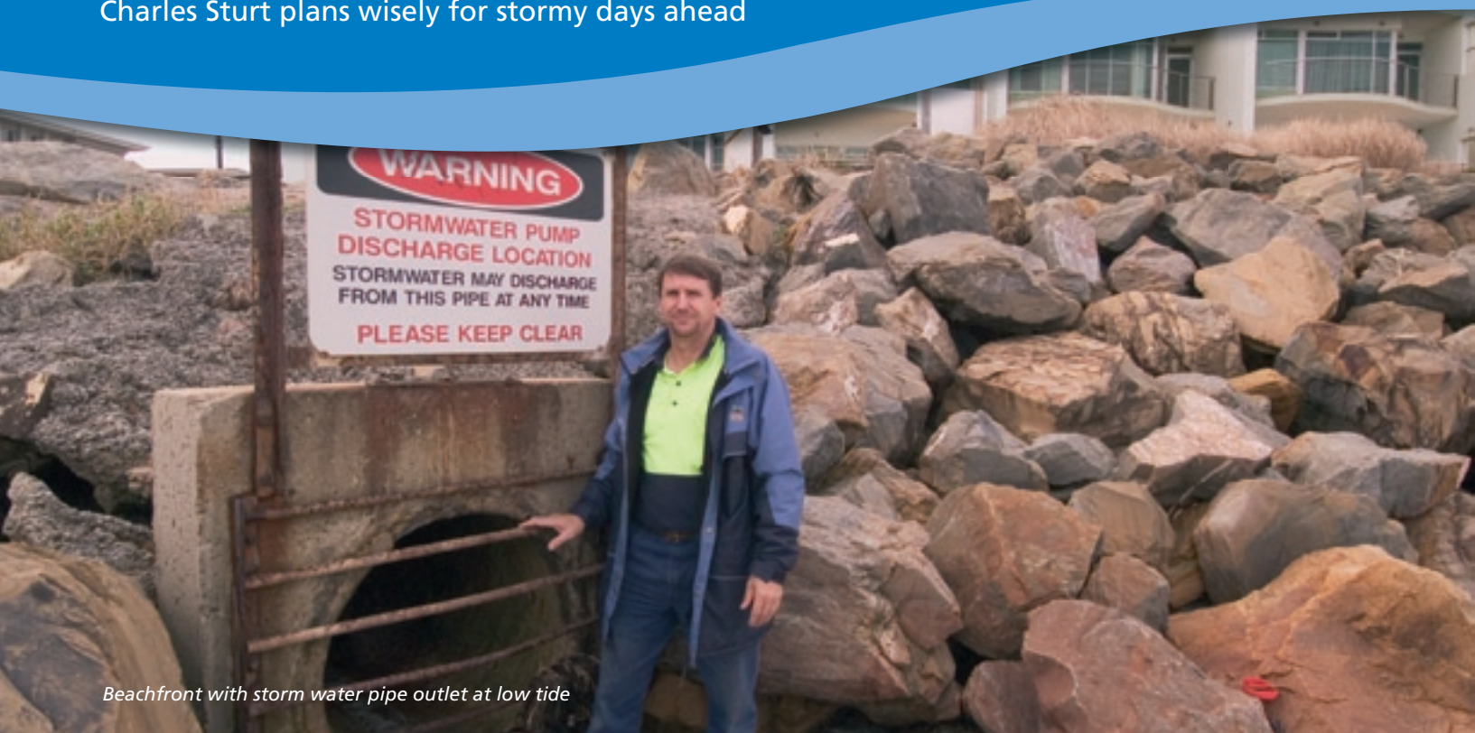
Beachfront with storm water pipe outlet at low tide

Charles Sturt plans wisely for stormy days ahead